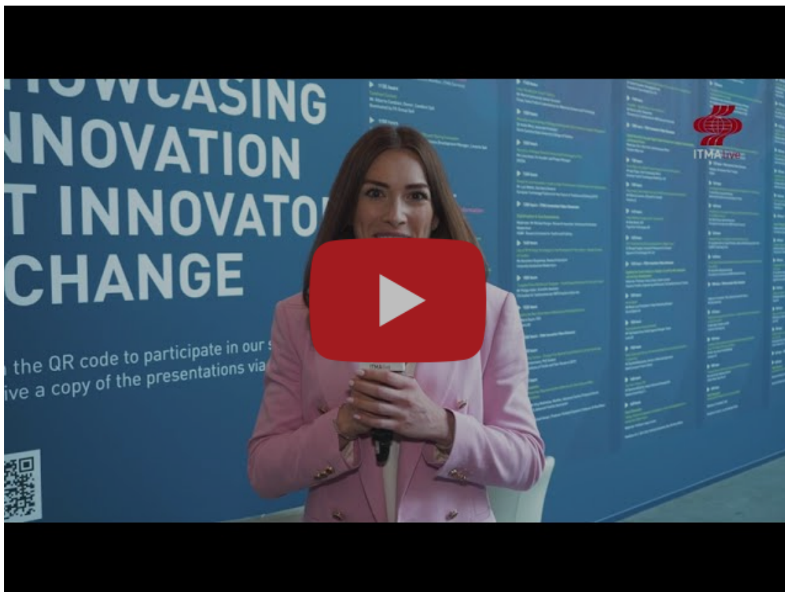
ITMA Live News Flash 5: Innovations Shaping the Future of Textiles and Garment Manufacturing Processes