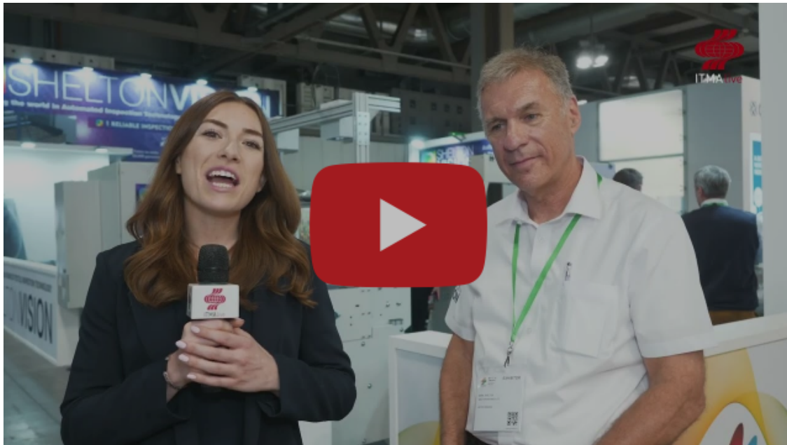
ITMAlive News Flash 4: Revolutionising the Digital Future of the Textile World with Automation

From next-generation smart sensors to the deployment of AI-powered robots for the automation of tedious production processes with improved precision, visitors at ITMA 2023 had a front-row seat to catch a new spin on the manufacturing future that spans the entire textile and garment production ecosystem.