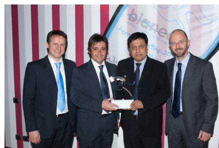
Pictures show different moments of the Agency meeting which took place at Bianco plant in Alba on March 2011. More than 50 agents, coming from all around the world attended that event. The nearby photo shows the award presentation at the end of the meeting.